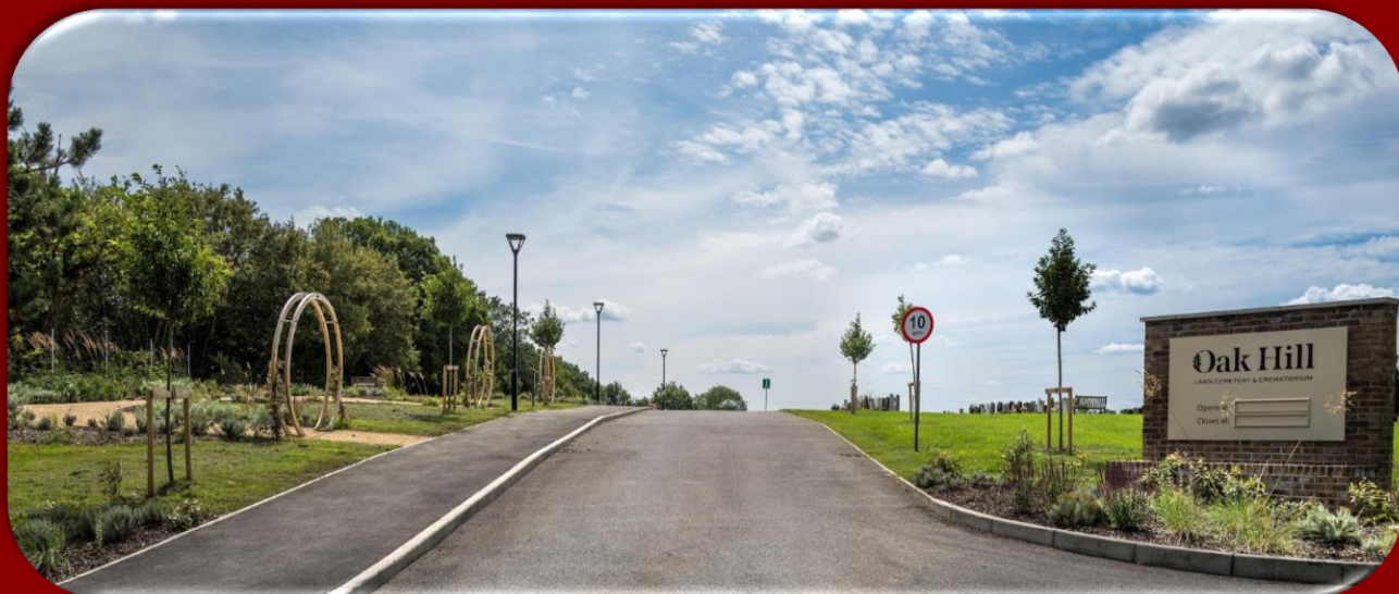
The CYA Award for Best New Entrant: Small Cemetery (up to 10,000 graves): Oak Hill Cemetery, Hertfordshire