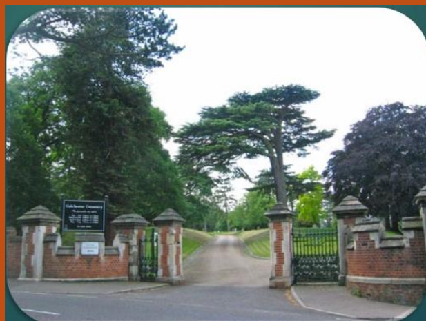
The CYA Award for Best New Entrant: Large Cemetery (over 10,000 graves): Colchester Cemetery, Essex.