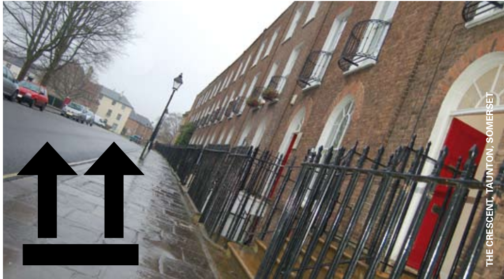
THE CRESCENT, TAUNTON, SOMERSET